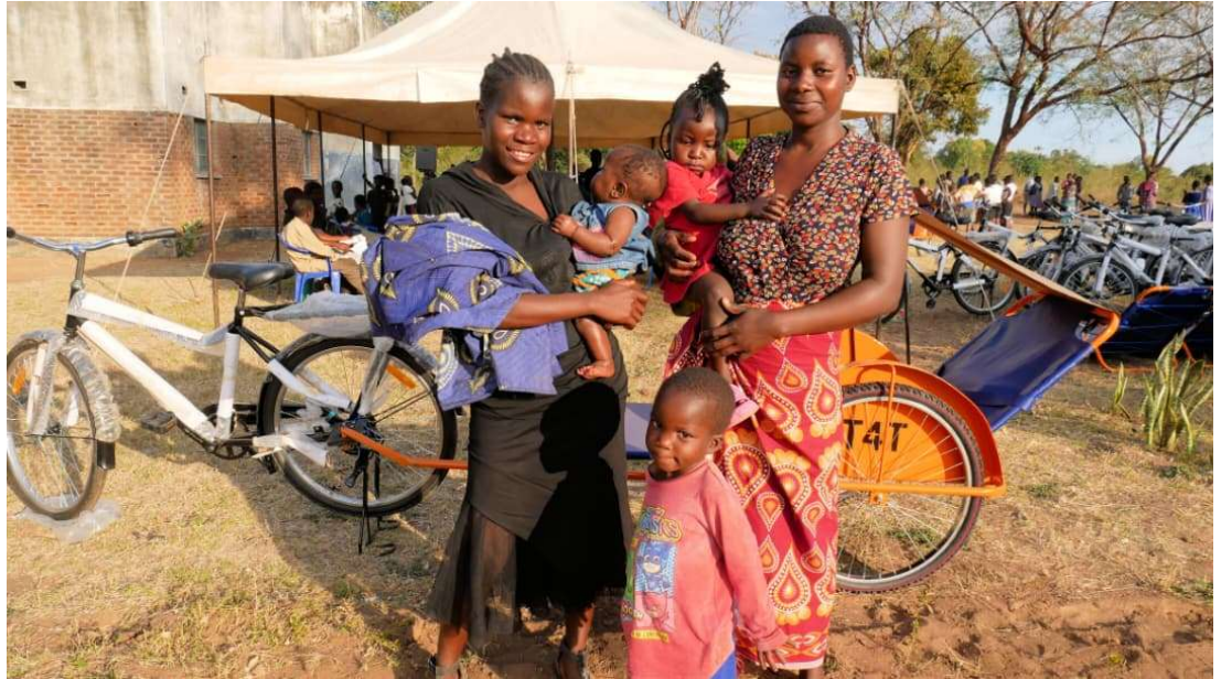
Very young mothers in Mthumba Village, Balaka District, Malawi, during a bicycle ambulance distribution programme.