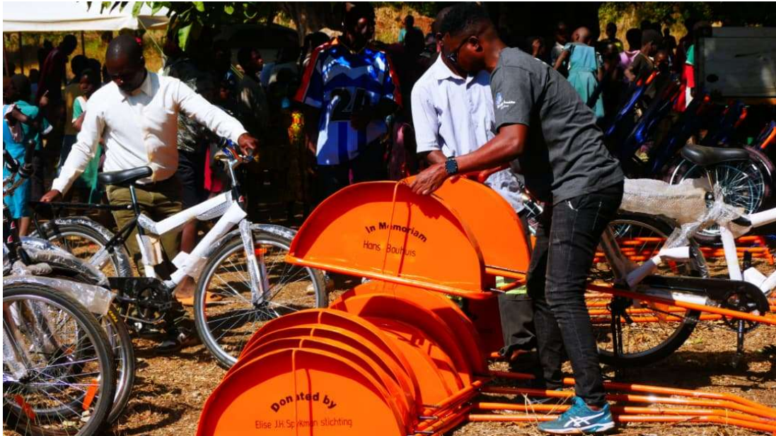
We also involve local communities in the assembly of the bicycle ambulances.