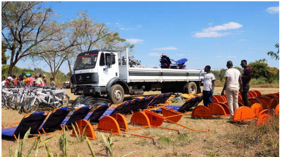
Preparation and assembly of the bicycle ambulances before distribution.