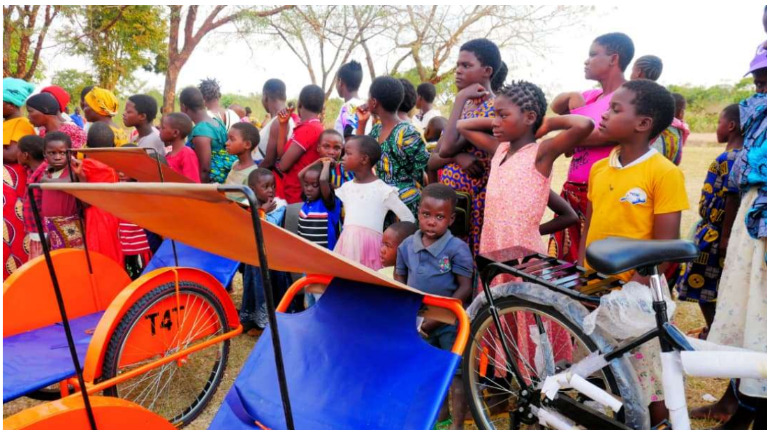
A major distribution event, always celebrated with singing and dancing.