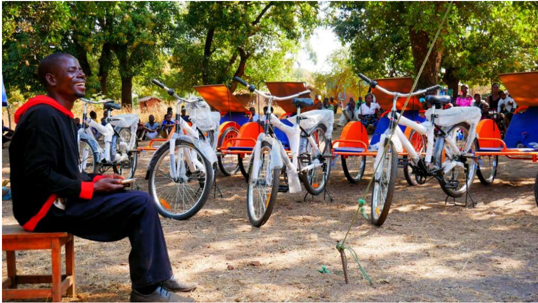
Completed bicycle ambulances ready for distribution.