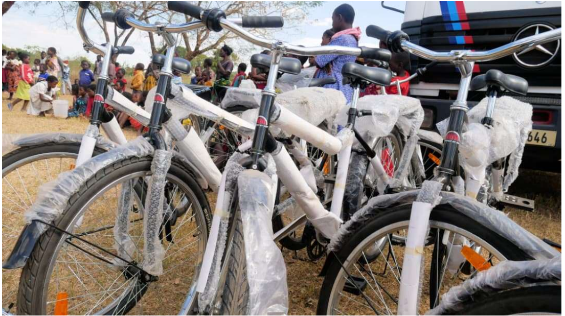
The bicycles are imported from Zimbabwe, as they are more durable than those available in Malawi.