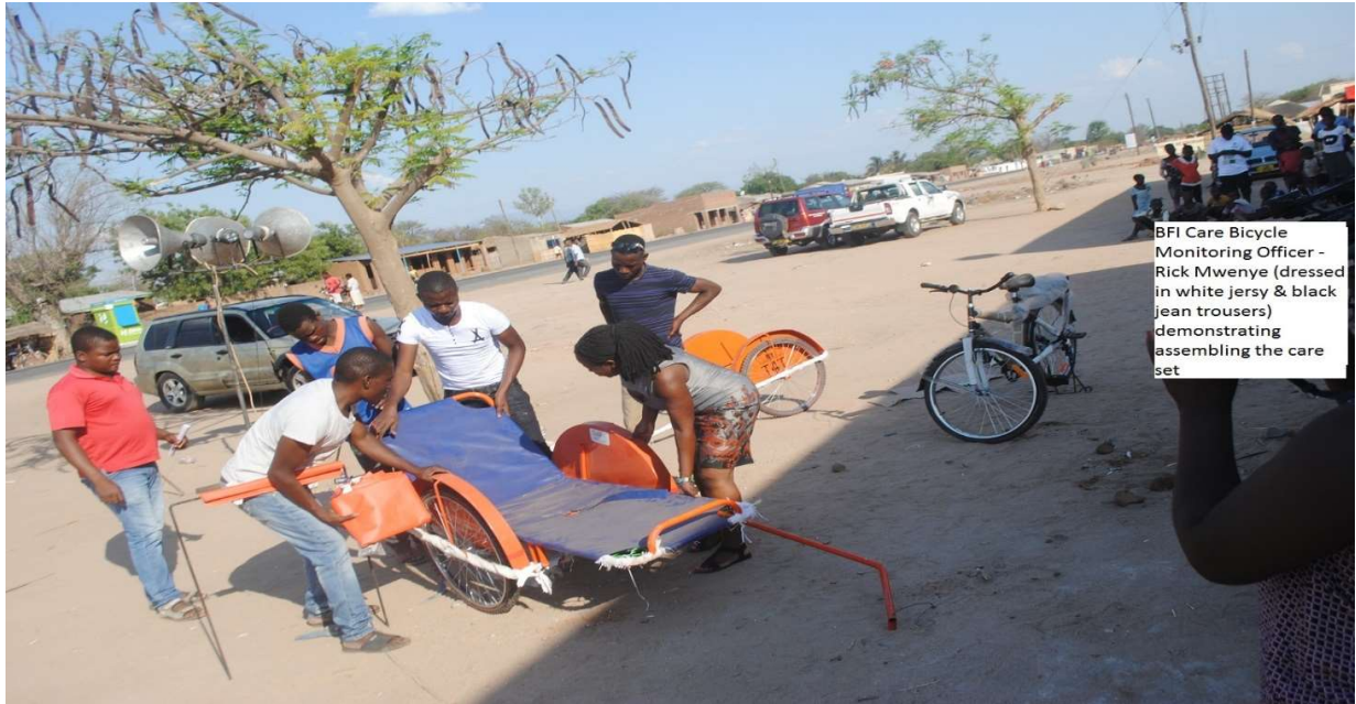
Figure 7 BFI Monitoring Care Bicycle Officer Leads in demonstrating assembling the care set