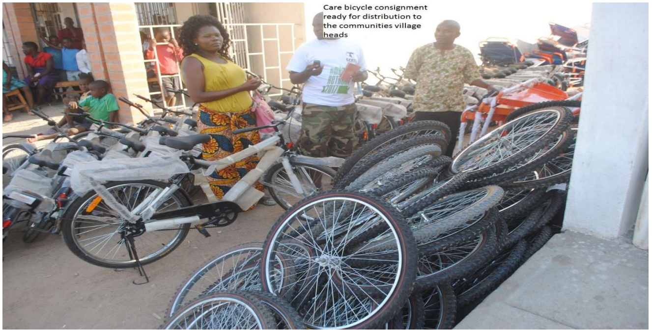
Figure 2 A consignment of unassembled care bicycles ready for distribution