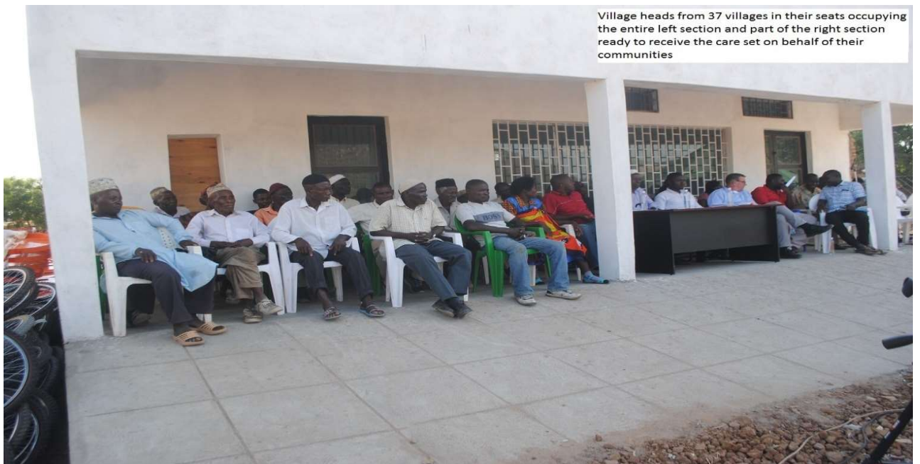
Village heads from 37 villages in their seats occupying the entire left section and part of the right section ready to receive the care set on behalf of their communities