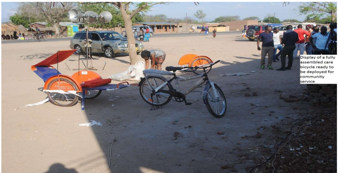
Figure 10 Display of assembled care bicycle ready for use

The community representatives received training of how to assemble the set. CISER through BFI pledged to maintain the care bicycles free of charge.