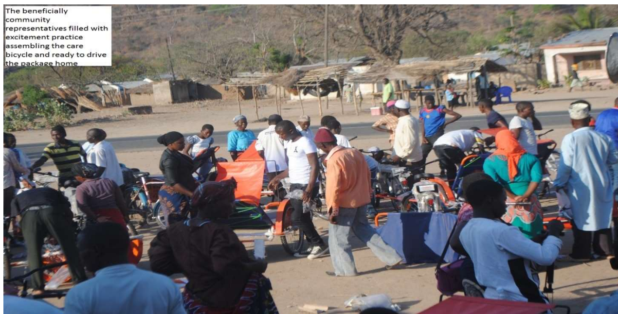
Figure 11 Community representatives practice assembling the care bicycle set